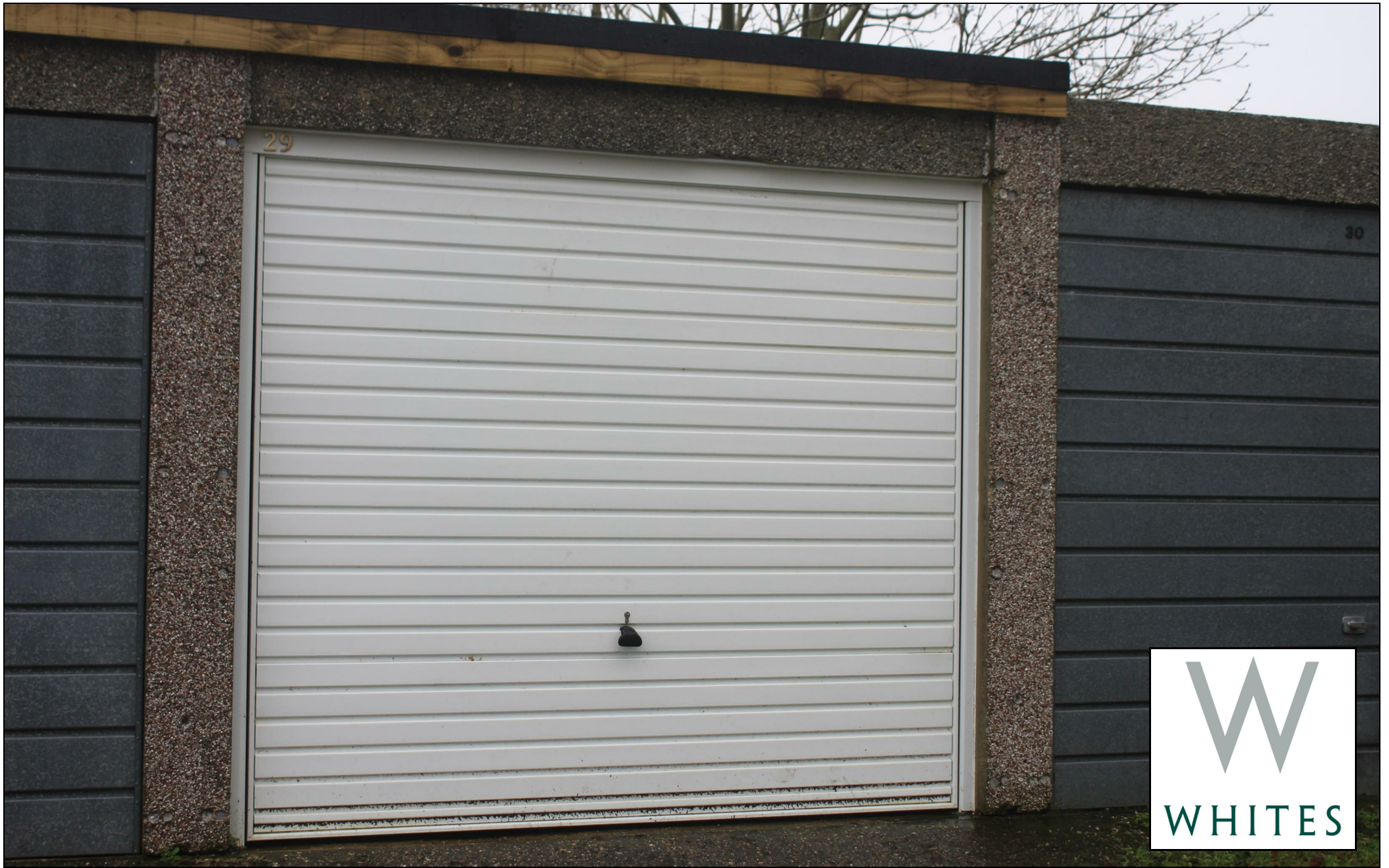
Garage 29, St Francis Road, Salisbury, Wiltshire, SP1 3QP